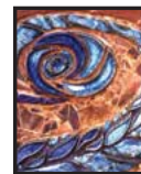
IMAGE: 0x0 | 8'H x 5.33'W x 3.33'D